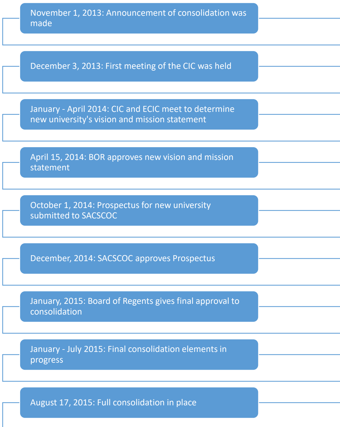
Figure 2. Timeline for Consolidation between State University and Middle State University

headed by an Area Coordinator who was a member of the CIC. Some Area Coordinators coordinated more than one area.