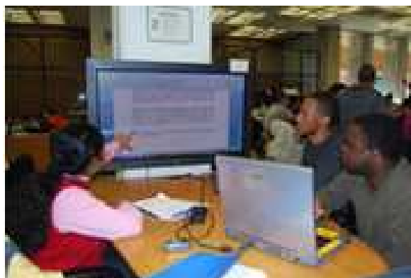
University of Connecticut