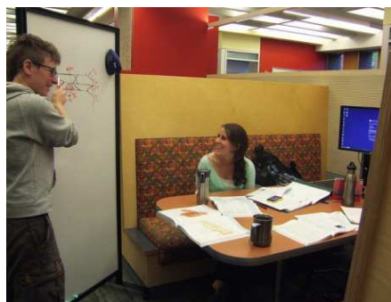
University of Pennsylvania