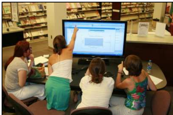
University of North Carolina Asheville